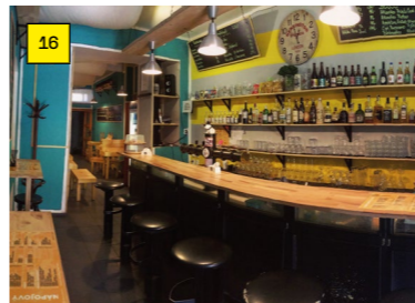
PUB U DVOU PŘÁTEL TÁBOR 25, BEETHOVENOVA 7

You can choose from eight types of beer from the Lobkowicz group (e.g. breweries Jihlava, Černá Hora, Protivín or Uherský Brod). The ordering goes through tablet displays with the current prices of all items on the beer menu. If you are hungry, you can try the hot-dog which stretches almost two-feet in length.