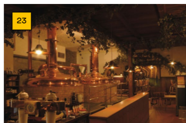
PEGAS JAKUBSKÁ 4

Of course you will find Starobrno on tap (four different types), as well as some other beers from the Heineken group. The local chef is able to satisfy your appetite with some traditional dishes, as well as steaks or salads.