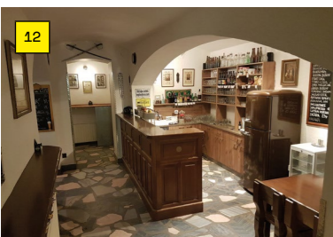
PIVNICE NA ŠRÉBRÁKU JUGOSLÁVSKÁ 34

Available here is the well-known Primátor beer (11° and 12° types), usually five other Czech beers – some of them real rarities – and at least one beer from abroad. This is the daily offer of tap beers, and besides this there is also a selection of dozens of bottled beers. The beer can be accompanied by meat pâté “rillettes” from a local small producer. All combines to make you feel like you are in a beer drinker’s paradise!