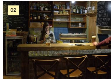
U ALBERTA PELLICOVA 10

reminiscent of the atmosphere of Soho Square in London or some seaside resort promenade. The concept of the taproom arises from the tradition of the 20 o and 30 o of the last century. The experienced bartenders (men only!) will serve you beers besides your regular pint, such as the half portion called a “šnyt” (still in a regular pint mug). As for food you can try, for example, the rediscovered specialty called a “talián”.