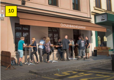
OCHUTNÁVKOVÁ PIVNICE LIDICKÁ 10

Add quirky and sometimes rather unpredictable staff – exchanging an empty beer mug for a full one without asking – as well as the unique atmosphere forming a special “genius loci” or “spirit of the place”, and you are not surprised that there are many visitors who are willing to drink their pint standing outside on the pavement in front of the door.