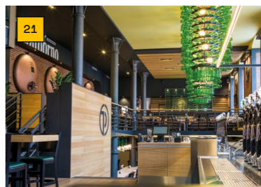
PIVOVARSKÁ STAROBRNO MENDLOVO NÁMĚSTÍ 20

You can look forward to their newly refurbished interior and, of course, to their traditionally excellent Pilsner Urquell served freshly from the tank. You won’t regret it, if you order a meal right here. You will find many smoked specialties as well as some other typical, traditional meals on the menu.