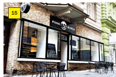
PIVNÍ BURZA VEVEŘÍ 21, JÁNSKÁ 16

The offer of beers changes every single day. Usually there are five to six different craft beers from small Czech breweries – types of beer not very often seen in common, regular pubs. Of course you can also order some snacks here.