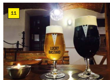
LUCKY BASTARD BEERHOUSE BRATŘÍ ČAPKŮ 8

The pub is renowned among experts for organizing guided tasting events every month, usually supervised by brewmasters of the presented breweries.