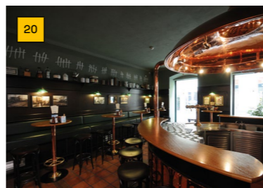
STOPKOVA PLZEŇSKÁ PIVNICE ČESKÁ 5