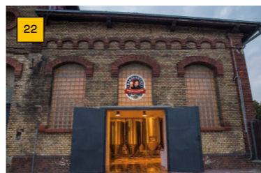
PETR HAUSKRECHT – PARNÍ PIVOVAR PORÁŽKA 3

The Pilsner Urquell in this pub restaurant used to be known far and wide in the past and it must be said that the quality has remained very high to this day, served as it is from the “beer tank”. You can also enjoy a meal here – for example lamb sausages with chilli beans or some typical Moravian dish with cabbage (or better known here as “sauerkraut”)!