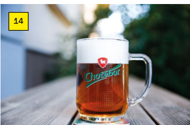
U SAJMONA POD HÁJKEM BOTANICKÁ 28

The most important elements are the friendly atmosphere with diligent staff and especially the quality of beers on tap – among the five different types there is always the 12° from Polička and another four Czech craft beers.