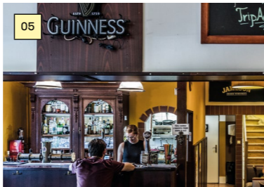
THE IMMIGRANT VEVEŘÍ 57

The relaxed bartender will serve you a tasty beer from Polička (filtered or non-filtered), as well as some delicious specialties, e.g. bread with matured cheese called “tvarůžky”, bread with streaky bacon or with roast beef.