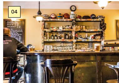
PIVNICE U MÍČE STAŇKOVA 15

You can enjoy the friendly atmosphere here over your pint: the patrons help themselves to a slice of bread topped with a special matured cheese while the children of tired fathers use beer mats to try building columns or pyramids.