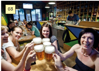
NA BOŽENCE B. NĚMCOVÉ 18

technology of breweries in Hustopeče and Chotěboř. The “fixed star” among the beers is the 11° called “Šalina” (the Brno word for “tram”). Four of the five types of beer on tap are produced locally. Besides beer you can also order a number of premium spirits, e.g. rums from the Caribbean or fruity hard liquors from the Czech Republic’s own Jeseníky Mountains.