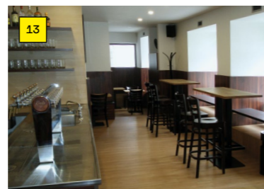
PIVNICE U TEKUTÉHO CHLEBA MORAVSKÉ NÁMĚSTÍ 14A

Besides the beers there is a portfolio of around twenty types of gin of the highest category behind the bar. For visitors with musical talent a piano is waiting – just ready to be played.