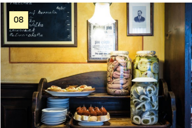
U BLÁHOVKY GORKÉHO 54