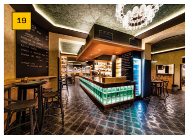
U ČÁPA OBLNÍ TRH 10

MON-THU 5 PM – 11 PM FRI 5 PM – midnight SAT-SUN 5 PM – 11 PM www.lipjaknavete.cz