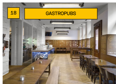
LOKÁL U CAIPLA KOŽÍ 3

In case you want something different from the selection of tap beers, there is the offer of chilled bottled beers – some of which are really rare limited editions.