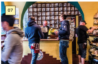
PIVNICE U POUTNÍKA STAROBRNĚNSKÁ 18

Local patrons – and there are usually many of them – are proud of the good quality beers and speak highly of food served, e.g. bread with matured cheese called “tvarůžky” or smoked meat. Historically, this is one of the very first pubs in Brno for non-smokers – the ban on smoking had been valid here for several years before the nationwide ban.