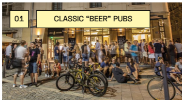
VÝČEP NA STOJÁKA JAKUBÁK BĚHOUNSKÁ 16, PEKAŘSKÁ 2

LAMBIC – spontaneously fermented beer originally from Belgium, actually a type of wheat beer.