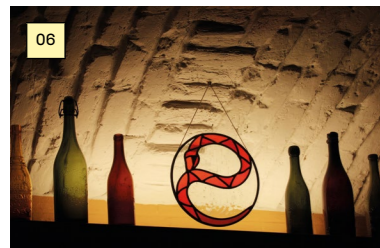
HLUCHÁ ZMIJE VEVEŘÍ 55

Besides the Czech language you can often hear English spoken here and in the glass jar titled “tips” you will see scarcely any Czech crowns.