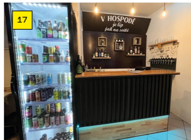
LÍP JAK NA SVĚTĚ GROHOVA 17

During the guided tour you will see the technology, smell the hops and taste the local craft beer. They produce 11° and 12° as well as one special beer here all year round, plus a lighter 10 beer (called Špilberk) in the summer.